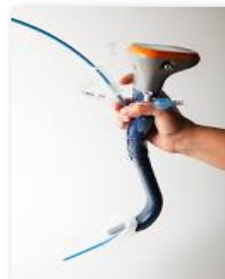
Image 1: The size 4 Totaltrack® VLM with bougie-guided assistance.

Use of the Totaltrack® VLM resulted in adequate oxygenation and ventilation throughout both placement and intubation attempts in all patients. The Totaltrack® VLM was successfully placed and facilitated tracheal intubations in 25 patients (83.33%) during the first intubation attempt ( Figure 1 ). More than one attempt was necessary in 5 patients (16.67%). Three of these 5 patients were successfully intubated with the Totaltrack® VLM on the second attempt. Failure to intubate (abort) with the Totaltrack® VLM occurred in 2 patients, despite POGO scores of 100 and bougie assistance. As a result, the Totaltrack® VLM provided an overall intubation success rate of 93.3% (95% CI: 77.9%-99.2).